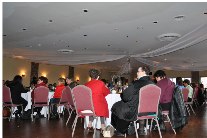
All enjoyed a beautiful Women in Business holiday event at the Inn at Pocono Manor

The December Women in Business luncheon, sponsored by Wayne Bank, was held at the Inn at Pocono Manor. The luncheon featured a "Shoppers Showcase" featuring different vendors with great gift ideas, and the traditional Ornament Exchange.